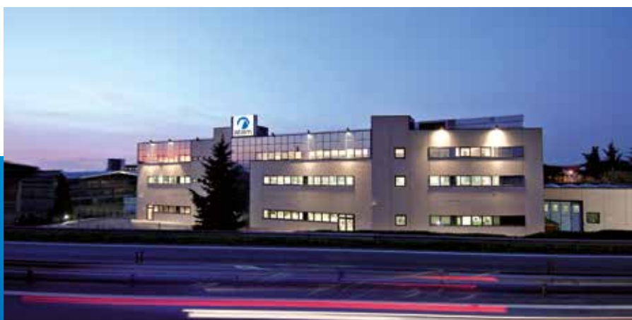
Agrade Brianza Production Plant