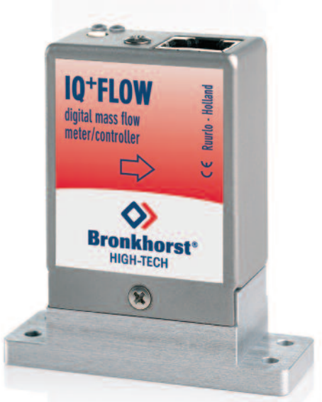
IQF-200 Downported Mass Flow Controller (Picture scale 1 : 1)

IQP-700 Pressure Controller (Picture scale 1 : 1)