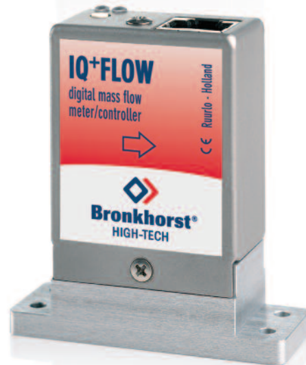
IQF-200 Downported Mass Flow Controller (Picture scale 1 : 1)