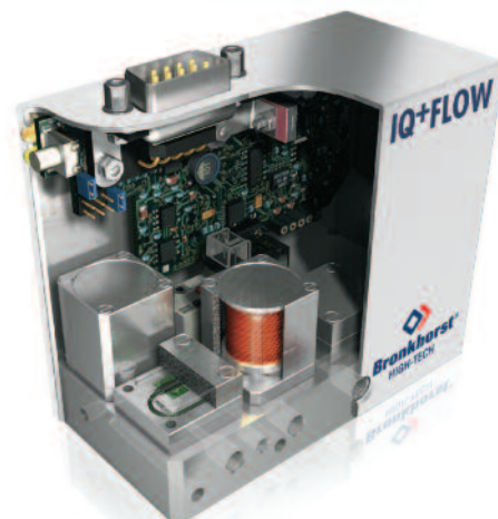
Example of customised manifold solution with Flow / Pressure Control