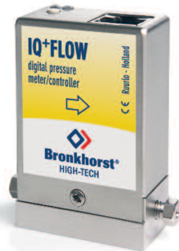
IQP-700 Pressure Controller (Picture scale 1 : 1)