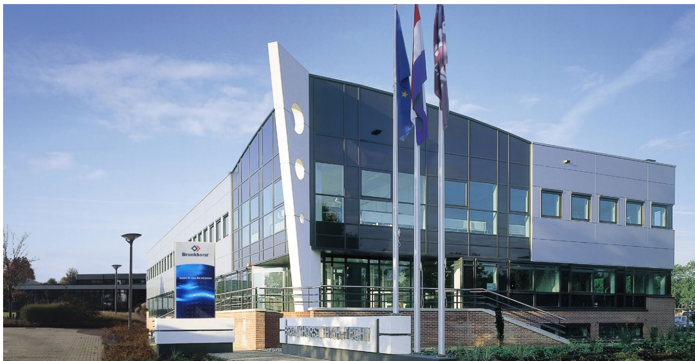
BRONKHORST HEADQUARTERS, THE NETHERLANDS