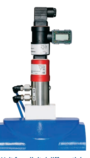
Volt free digital differential pressure manometer