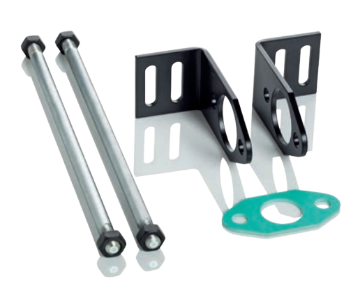
Wall mount including filter connection set