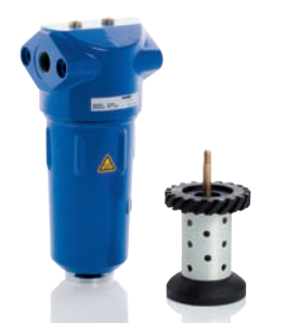
WS water separator with threaded ports

HC Hopcalite catalyst cartridge (removal of carbon monoxide CO)