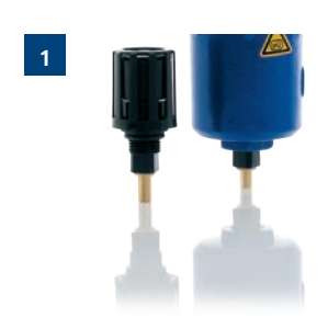
automatic drain D150, standard for threaded filter F25 - F135