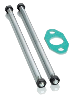
Filter connection set