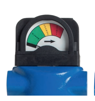
Differential pressure indicator