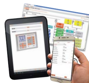
Software and applications