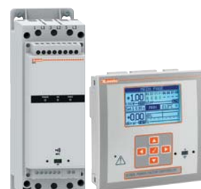
Metering instruments and current transformers