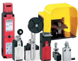
Limit, micro and foot switches