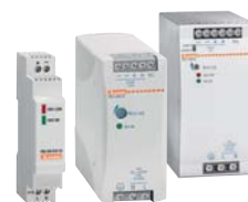
Switching power supplies