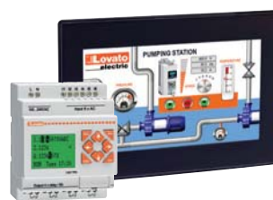
Micro PLCs and HMI