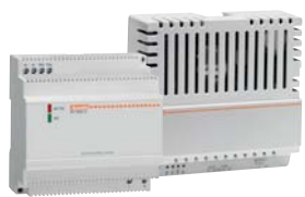
Automatic battery chargers