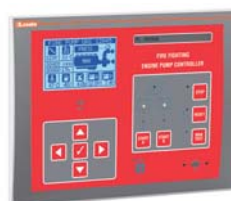
Fire pump controllers