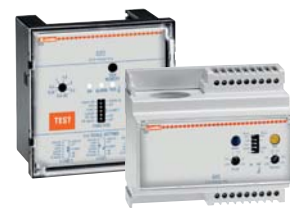
Earth leakage relays