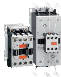
Motor protection circuit breakers