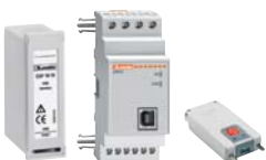
Expansion modules and accessories