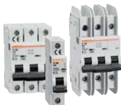
Miniature and residual circuit breakers