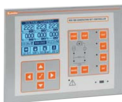
Engine and generator controllers