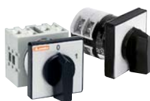
Rotary cam switches