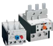
Motor protection relays