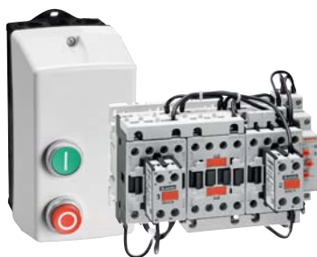
Electromechanical starters and enclosures