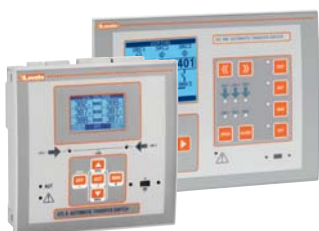
Automatic transfer switch controllers