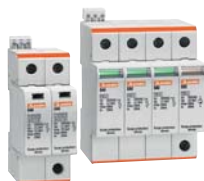
Surge protection devices