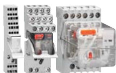
General purpose relays