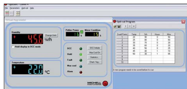
Logging and profiling software