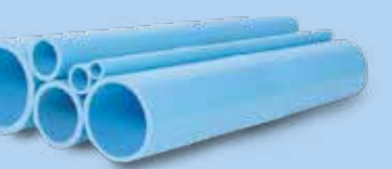
Composite alloy piping : PVR range