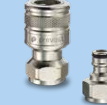
CPI quick couplings for cooling circuits (moulds)