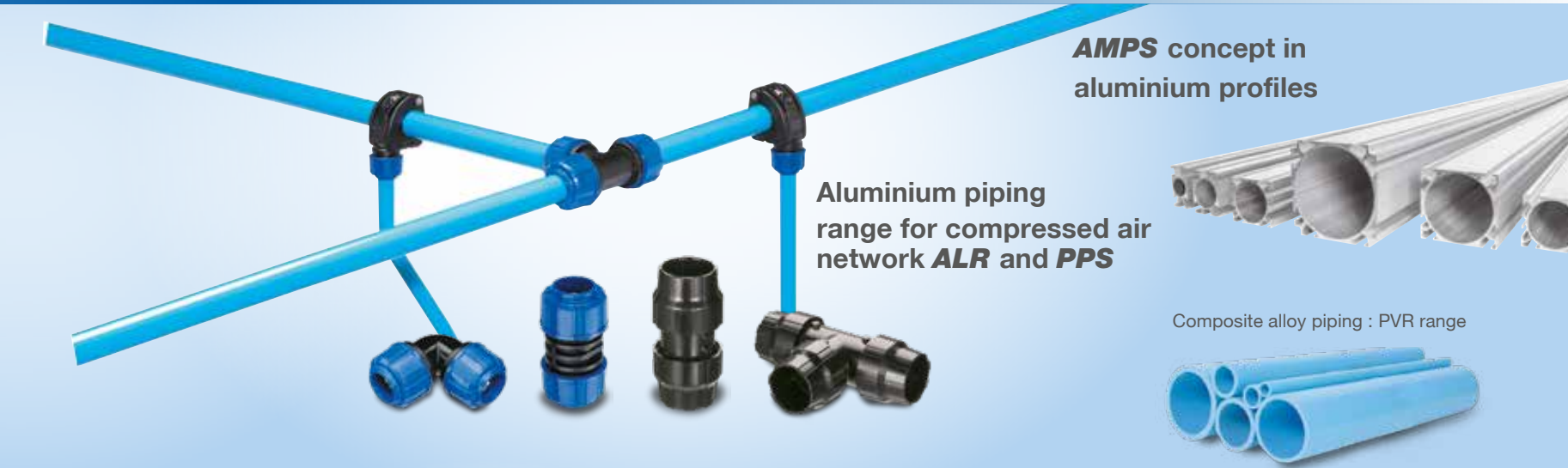
Aluminium piping range for compressed air network ALR and PPS