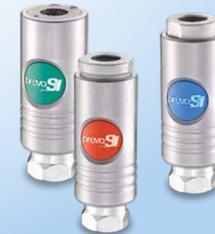
ISOFLAM safety couplings for welding torches