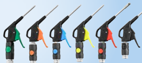
Blow guns prevoS1