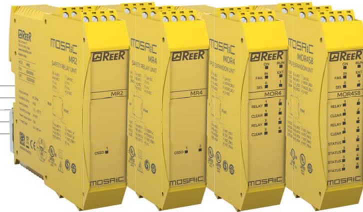
MR2 MR4 MOR4 MOR4S8