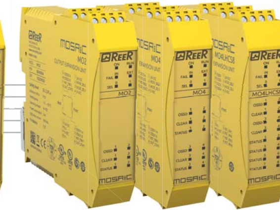
MO2 MO4 MO4LHCS8