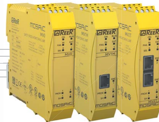
MV0 MV1 MV2