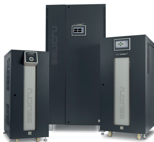
SLC CUBE3 +