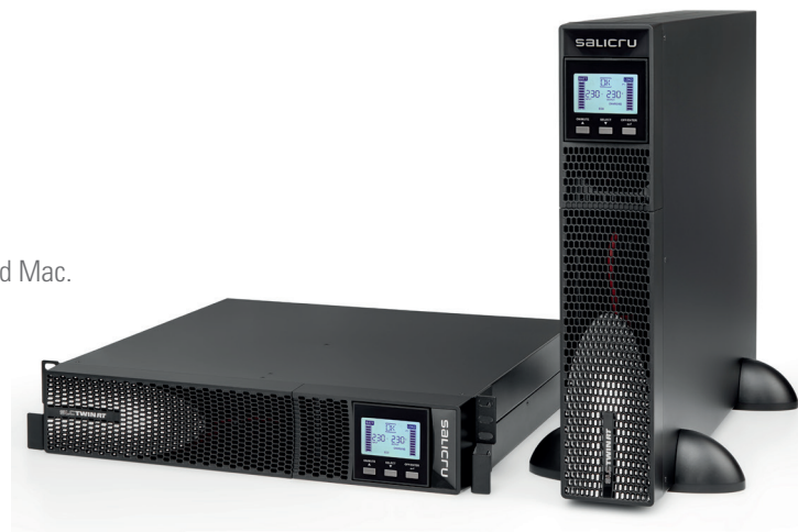
SLC TWIN RT2