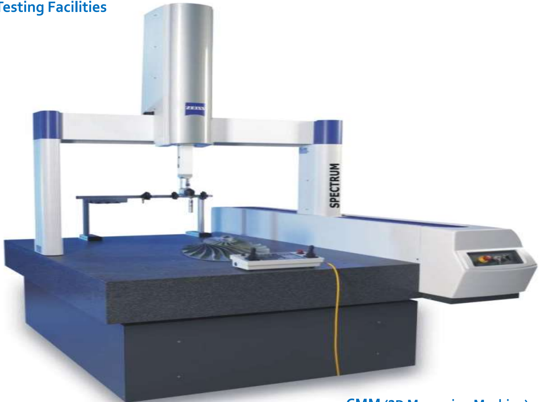
CMM (3D Measuring Machine)