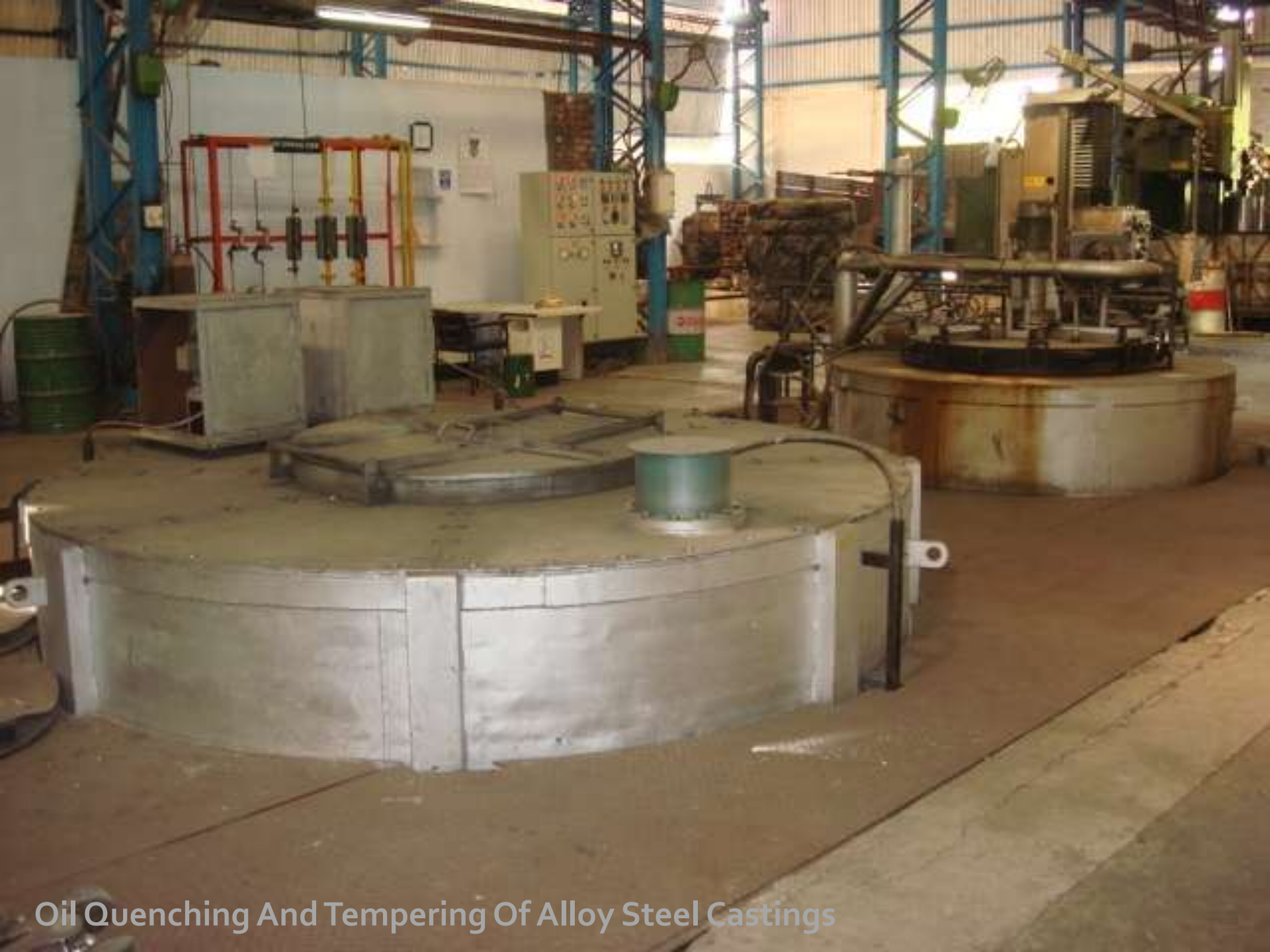
Oil Quenching And Tempering Of Alloy Steel Castings