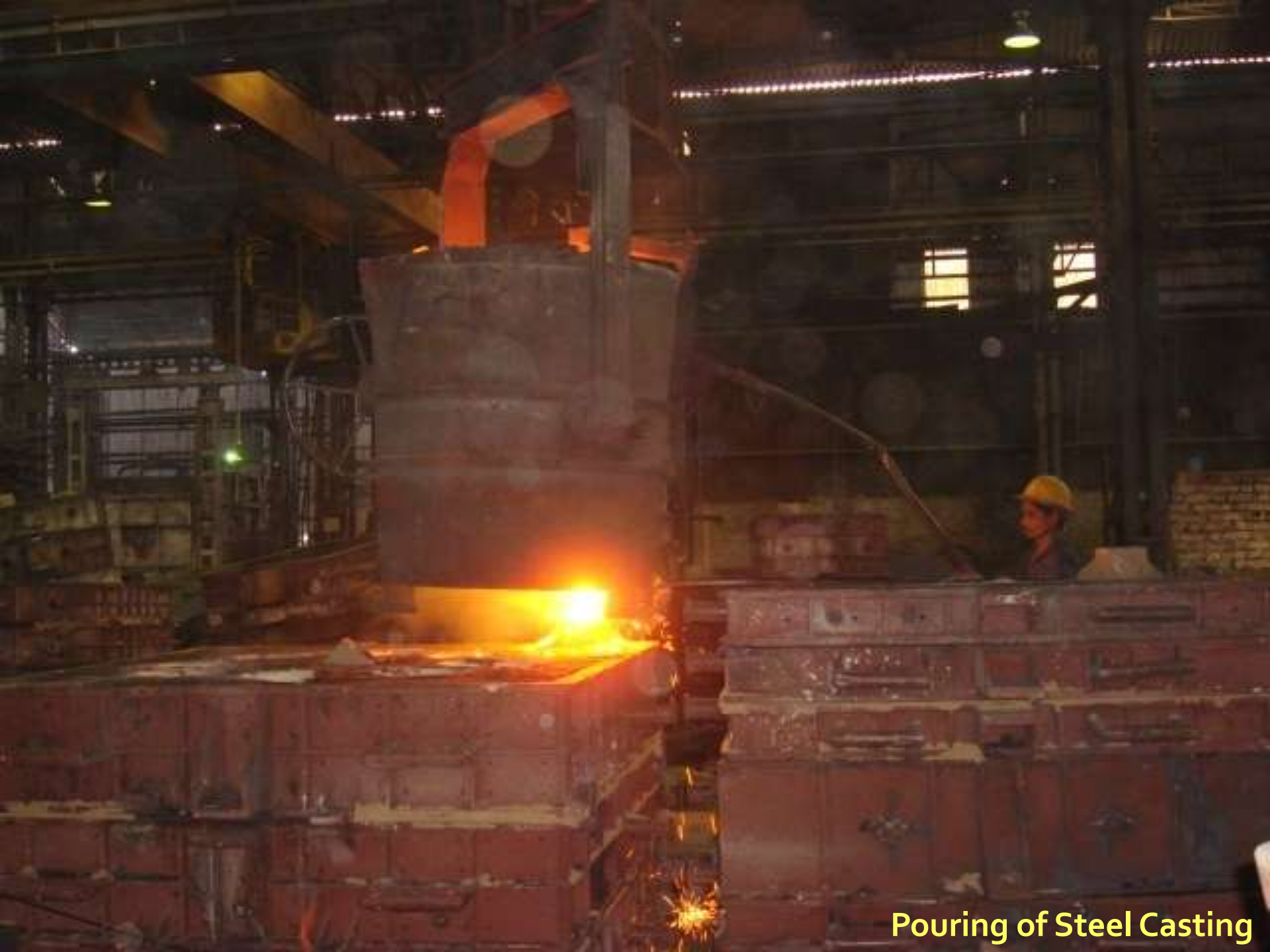
Pouring of Steel Casting