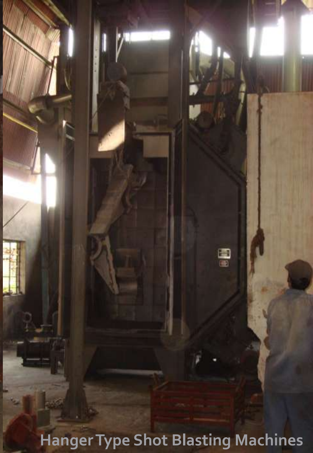
Hanger Type Shot Blasting Machines