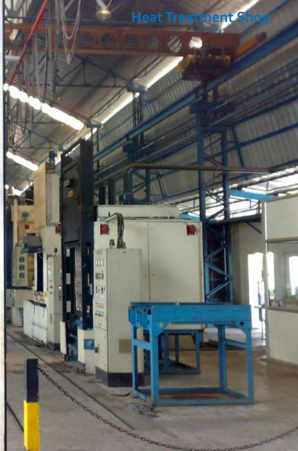
Heat Treatment Shop