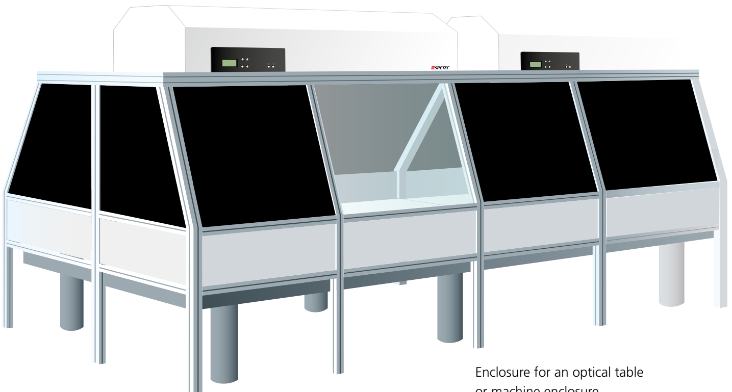
Enclosure for an optical table or machine enclosure

If required, a laminar flow module (FFU) can be fitted in the top of the enclosure to provide clean room conditions within the enclosure.