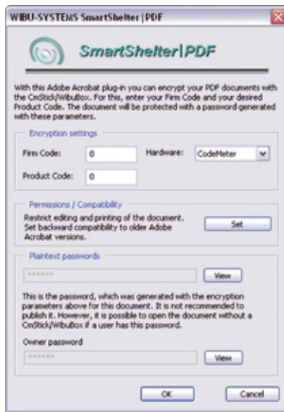
Dialog for encryption of the document

The Adobe Acrobat Reader opens the PDF document as usual. After detecting a CmStick with the suitable license code entry, the document will be opened. If the correct CmStick is missing, the password dialog pops up and requests that a password be entered manually.