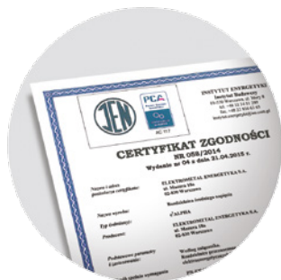
IEC Certificate no 058/2014