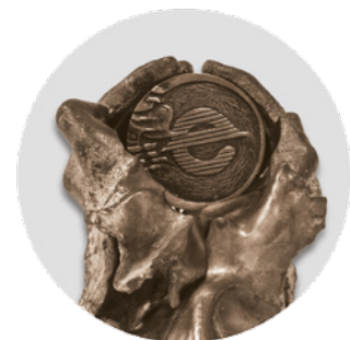
Bronze medal ENERGETAB 2014 Fairs