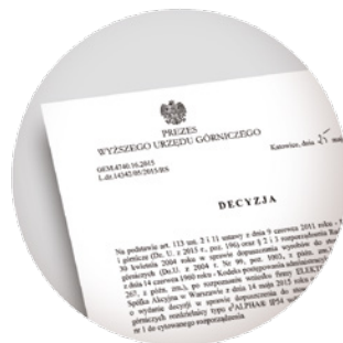
WUG Certificate no GE-16/15