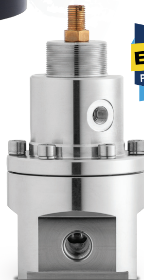
AUTO438 / AUTO875