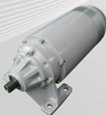
Ø135 High Power DC Motor with Planetary Gearhead