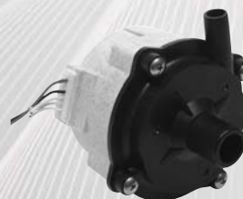
Ø79 24V Brushless DC Circulation Pump