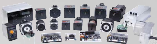
STANDARD BLDC GEARED MOTORS