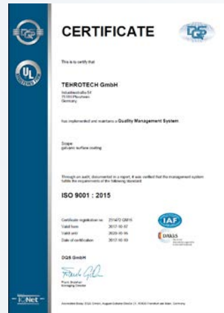
Certificate DIN ISO 9001 : 2015