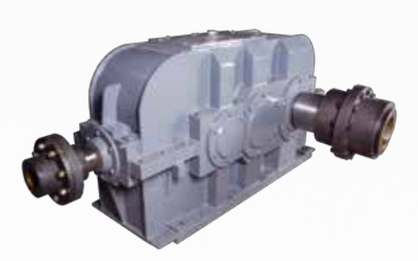
Apron Feeder Bevel Helical Gearbox