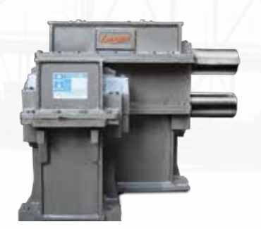
Mill Stand Gearbox