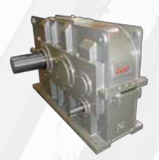
Kiln Helical Gearbox