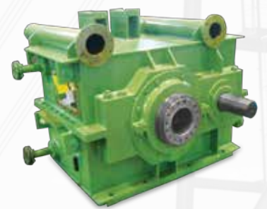
Entry Tension Reel Gearbox