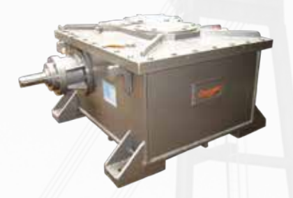
Coal Feeder Bevel Helical Gearbox