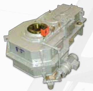
Coal Stacker Bevel Helical Gearbox