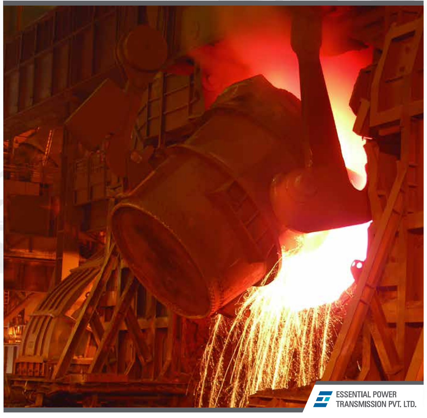
Mining | Bulk Material Handling | Mineral Processing | Pyro Processing | Primary Steel Manufacturing | Secondary Steel Manufacturing | Finished Steel Processing | Power Plants | Port Equipment