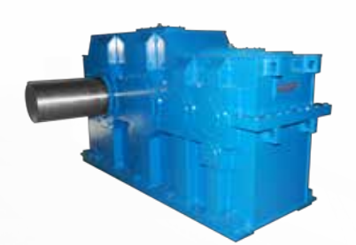
Rotary Kiln Helical Gearbox