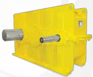
Main Hoist Helical Gearbox