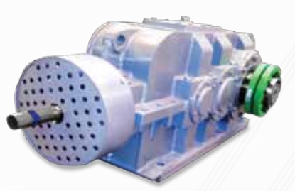
Conveyor Bevel Helical Gearbox