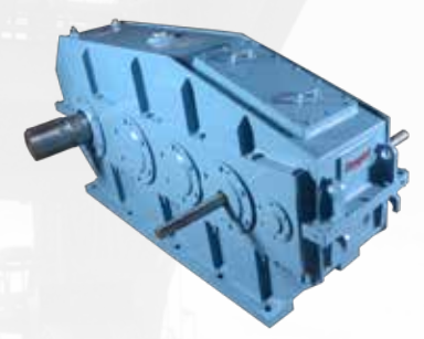
Main Hoist Helical Planetary Gearbox