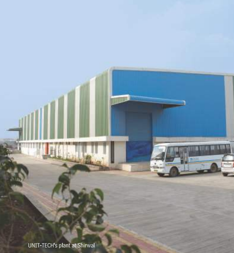
UNIT-TECH's plant at Shirwal