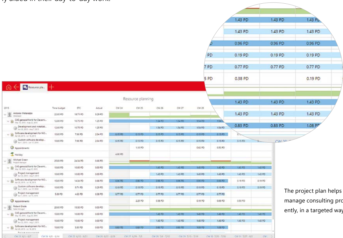
The project plan helps plan and manage consulting projects efficiently, in a targeted way.

The basis for successful customer communications is up-to-date address data. CAS Engineering automates your address maintenance based on user-friendly features. The customer dossier provides comprehensive information on individual contacts. Staff can see at a glance what projects are currently in progress where, and which colleagues are working on them. Personalized access rights ensure confidential cooperation and compliance with data protection requirements.