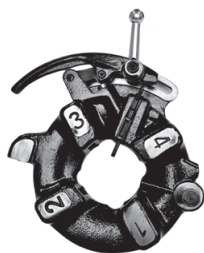
424 die head (standard)