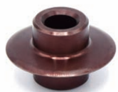
reinforced cutting wheel