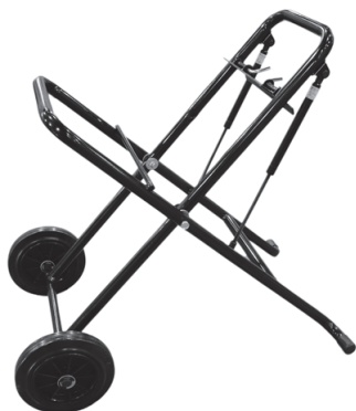
651 stand (optional)