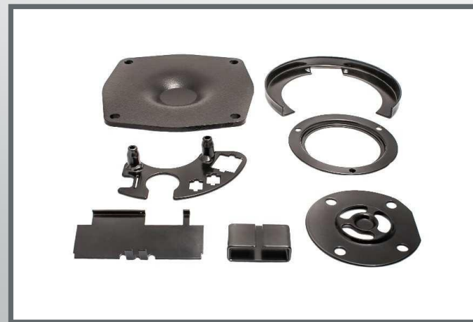
Picture: Metal Parts (carter and protections) Sector: Earth Moving Machines and Ceramic Sector