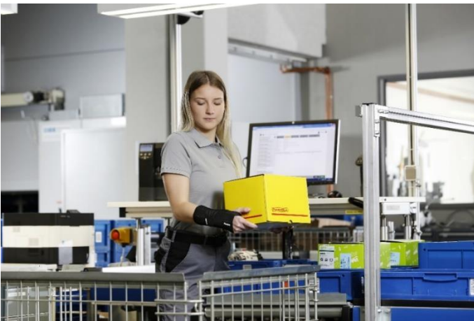
The new Paexo Wrist supports the wrist when the user lifts and holds heavy objects.