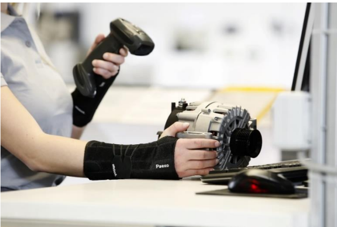
Ottobock based the Paexo Wrist on a medical device. It is used as a preventive tool in industrial settings to protect the wrists.