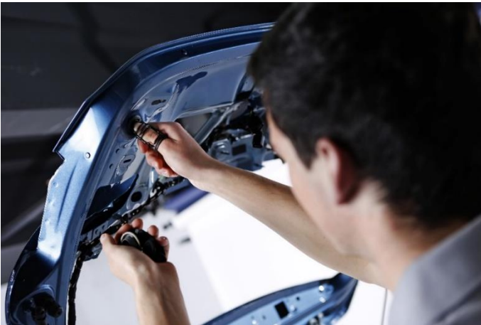
The smallest exoskeleton in the world – the Paexo Thumb – redirects forces from the thumb to the entire hand.