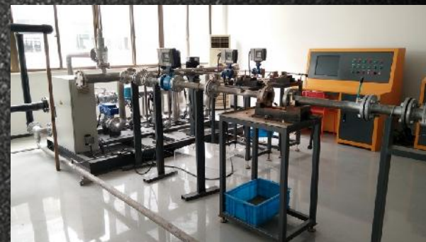
100% quality test