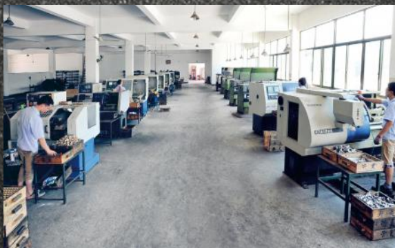
Strict manufacturing management