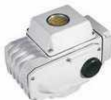
Electric Ball Valves