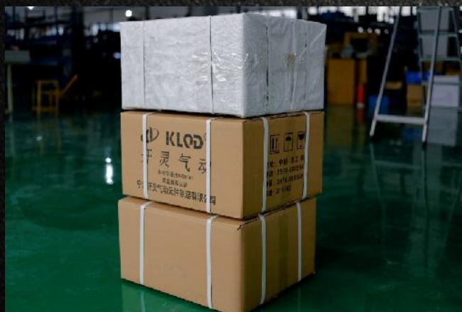
Professional and strong packing