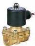
3 & 5 way Solenoid Valves