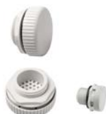
DA 284 (Plastic) IP66 / IP67