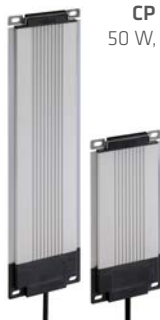
CP 061 50 W, 100 W