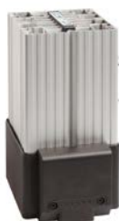
HGL 046 250 W - 400 W