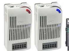
DCT 010 DC 20 - 56 V