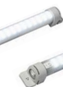
LED 021 (400 mm)