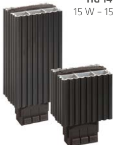
HG 140 15 W - 150 W