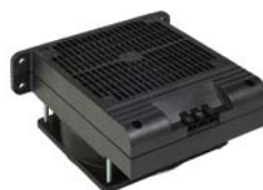
HVI 030 500 W - 700 W