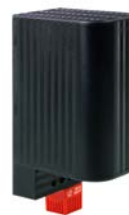
CSF 060 50 W - 150 W