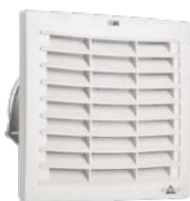
FPI 018 / FPO 018 up to 263 m 3 /h (176 x 176 mm)