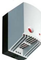
CR 027 up to 650 W