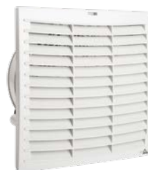
FPI 018 / FPO 018 up to 727 m 3 /h (291 x 291 mm)