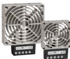
HV 031 / HVL 031 100 W - 400 W