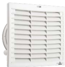
FPI 018 / FPO 018 up to 536 m 3 /h (223 x 223 mm)