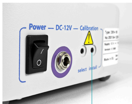
DEN-1B rear side with calibration controls

Application of DEN-1 for determining concentration of microbial cells of supernatant in tubes during centrifugation. Turbidity is determined in McFarland units.