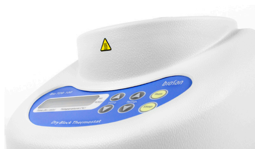
3 Block A-103