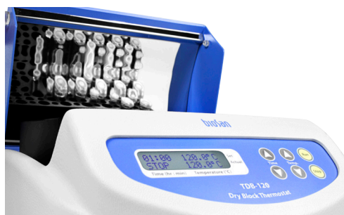
2 Block A-53

BS-010412-AAA BS-010401-QAA BS-010401-PAA