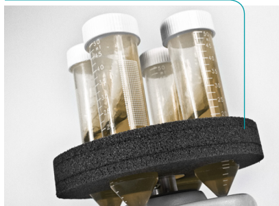
MSV-3500 with platform SV-4/30

Multi Speed Vortex MSV-3500 is designed for soft or intensive mixing of reagents in different size and type plastic tubes (0.2 to 50 ml).