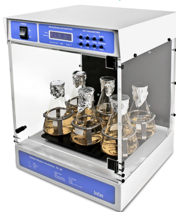
ES-20 with platform P-6/250