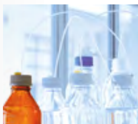
Solvents for HPLC