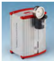
Rotilabo® diaphragm vacuum pump CR-MV100