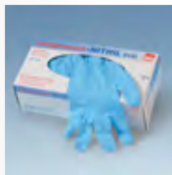
Rotiprotect® nitrile gloves eco