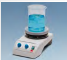
Rotilabo® Heating and magnetic stirrer MH15

► More information is provided in our Online Shop at www.carlroth.com