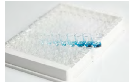
Strep-Tactin®XT Immobilization plate