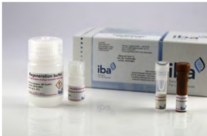
Twin-Strep-tag® Capture Kit