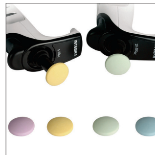
Plunger caps Color coded