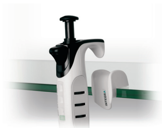
Shelf hook (3211)