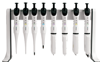
Linear stand (3215)

Storing pipettes upright is important to prevent liquid or debris from entering the tip fitting. Proper storage also extends the life of a pipette. The INTEGRA linear stand is ideal for hanging EVOLVE pipettes up off the lab bench. Up to twelve manual pipettes can be placed on a linear stand. EVOLVE shelf hooks are also available for proper storage.