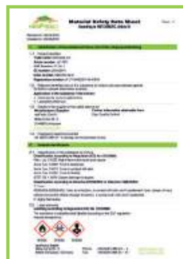
Material Safety Data Sheet (MSDS)

neoFroxx provides you with any document that is required to inform you about safe handling, physical data, quality parameters and application!