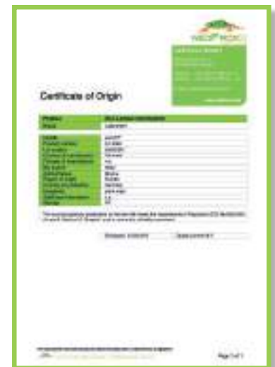
Certificate of Origin (CoO)

Certificate of Analysis (CoA) Our CoA's are automatically send via email and therefore nearly instantly available!