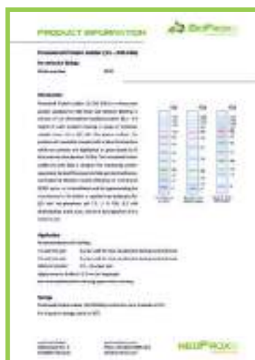
Product Information (technical data sheet)