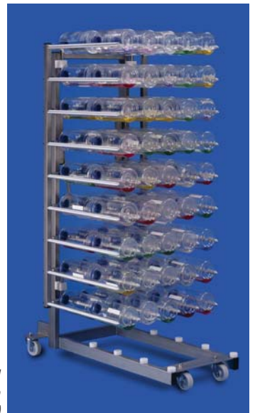
Bottle Lifter for loading or removing all bottles simultaneously from the INCUDRIVE 90 (optional)

Of course, the Bottle Lifter may also be transferred to a cooling room for cell disruption by freezing.