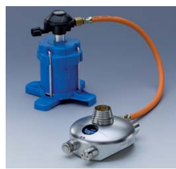
schuett phoenix II with C 206-adapter incl. pressure reducer and gas-safety hose as well as cartridge