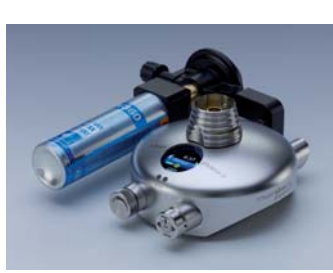
schuett phoenix II with CV 360-adapter incl. pressure reducer and cartridge