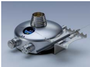
Instrument tray with inoculating loop holder, rotatable for optimum workplace convenience