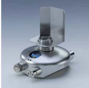
schuett phoenix II with flame shield