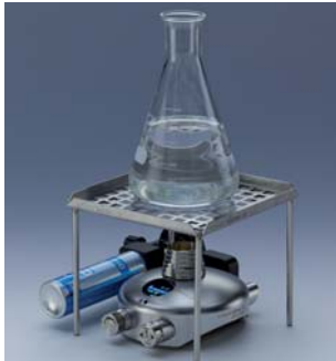
Hot-Tray with schuett phoenix II and CV 360-adaptor/cartridge for operation in chemical lab (height-optimized)