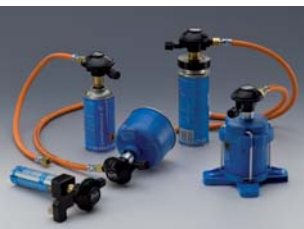
Choice of gas cartridges with adapters, partially including pressure reducer and gas-safety hose.