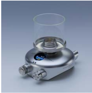
schuett phoenix II with glass spatter guard