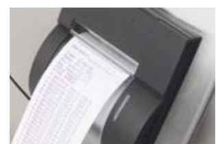
Systec Mediaprep printer for documentation