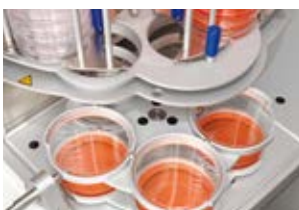
Systec Mediafill with Petri dishes