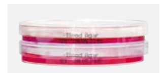
labelling on the sides of Petri dishes