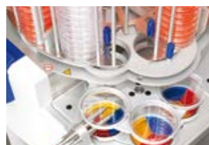
Systec Mediafill with Tri-Plates