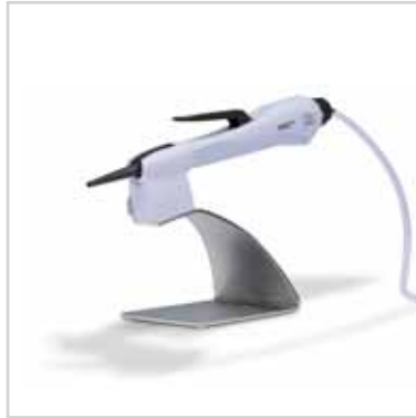
Complimentary range of accessories including table stand, tip ejector and BVC shuttle or adapter for eight pipette tips