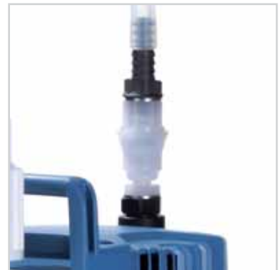
Quick-couplings PVDF - autoclavable, high chemical resistance (Standard only integrated with the BVC professional, available as an accessory for other variants)