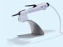
Table stand for VHC pro

Silicone tubing (minimum order quantity 2m).