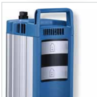
Non-contact liquid level sensor (only BVC professional) - wearfree, simple bottle exchange