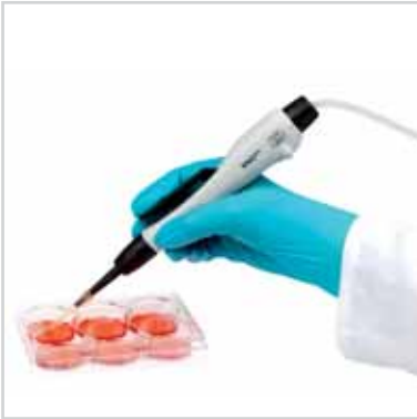
Patented, fully autoclavable, ergonomic hand set