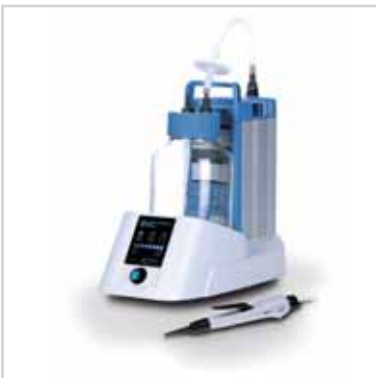
Version with glass bottle - for aggressive media, smaller quantities and quick autoclave