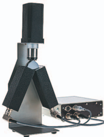
NP3 and NP4 Gradient system/injector