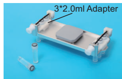
Holder and 2-3*2.0ml Adapter

Holder for 6*2.0ml and for 2*5.0ml FOR Bioprep-6