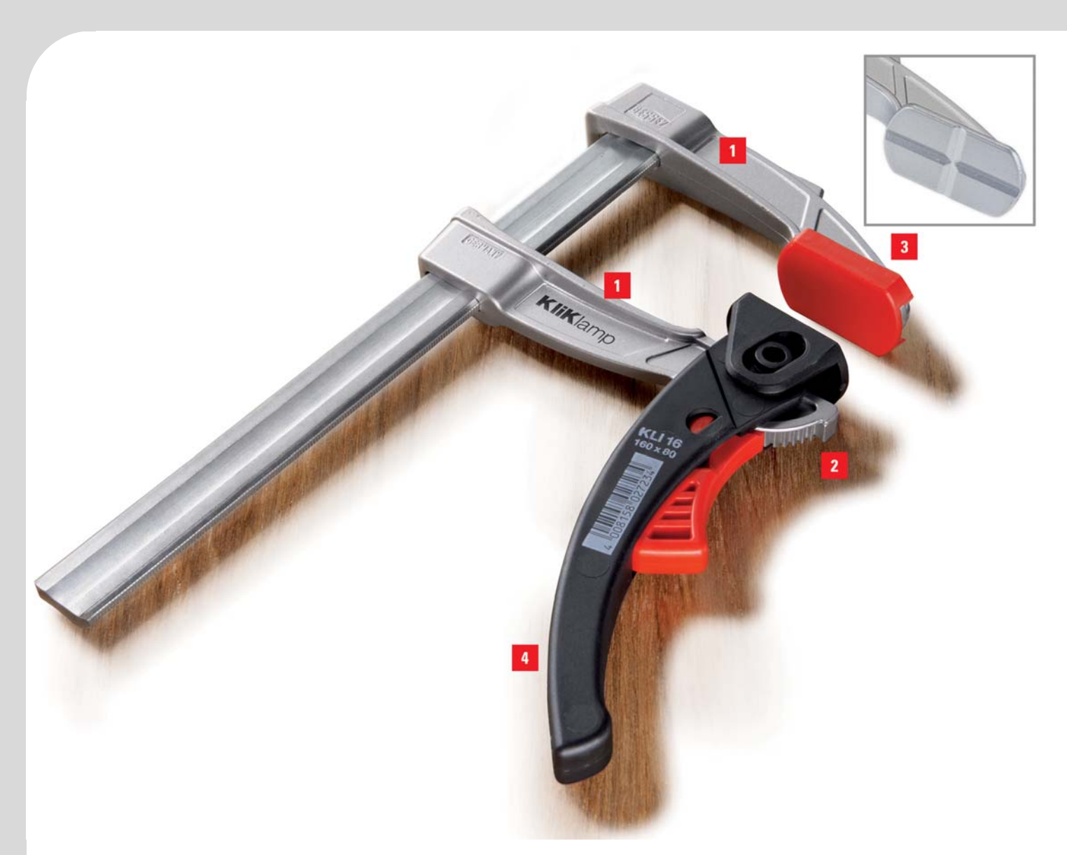
Light as a feather - tough as nails

Extremely lightweight, stable magnesium, fibre-glass reinforced plastics, and cold-drawn BESSEY quality steel: this optimum mixture is characteristic of the innovative high-tech KliKlamp lever clamp. That's why the smallest KliKlamp weighs just a tiny 260 g — simply ideal for assembly work or where several clamps are being used at once. The pressure is also built up easily and highly effectively: the ratchet mechanism lets you achieve a huge 1,200 N of clamping force quickly with just 2 fingers. You certainly will never have clamped as quickly, easily or as gently as this!