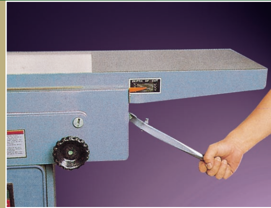
Table Raising and Lowering Mechanism

The large ground tables are balanced by durable strongsprings. They can be instantly vertical adjusted by easy reach hand lever without changing operator's position. The convenient locking knob prevents accidental table movement.