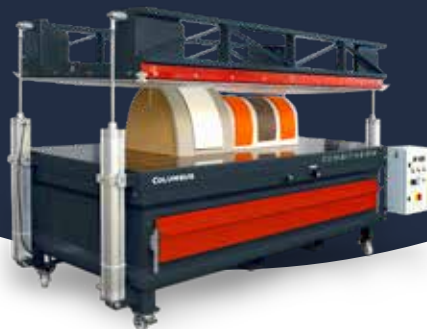
Combitherm with vertical opening mechanism