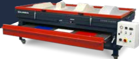
Combitherm with clamshell opening