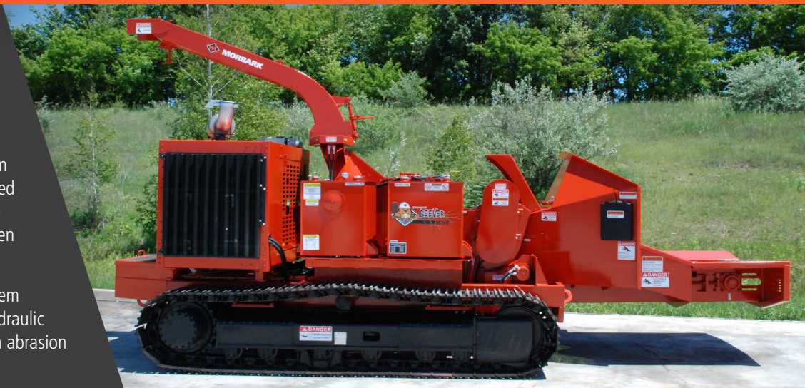
A 6' (1.83 m) infeed bed with live WDH-110 chain drive