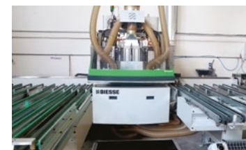
Flexible working center for boring - routing Brand: BIESSE Model: SKIPPER 130