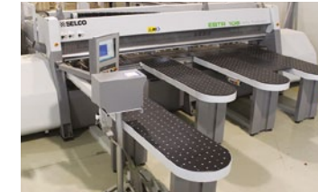
Numeric controlled beam panel saw Brand: SELCO Model: EBTR 108 TWIN PUSHER