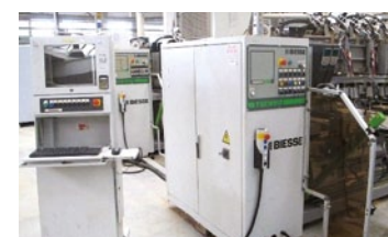
Automatic boring line Brand: BIESSE + RBO Model: TECHNO FDT CN + WINNER