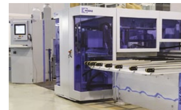
Flexible working center for boring - routing Brand: WEEKE Model: BHX 500