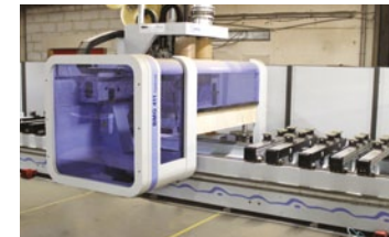
Working center for boring routing with 4 axes Brand: WEEKE Model: BMG 411