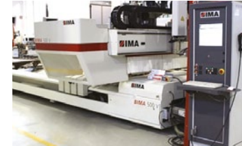
Working center for boring routing - edgebanding Brand: IMA Model: BIMA 500 V/160/530