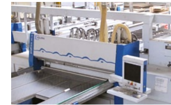
Numeric controlled angular beam panel saw Brand: HOLZMA Model: HFL 33 56/22 PROFILINE