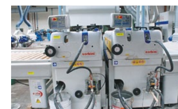
Tailor - made painting line Brand: FERWOOD ENGINEERING