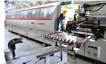
Single side edge bander Brand: IMA Model: NOVIMAT CONCEPT/ G80/540/L20