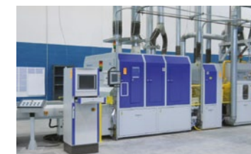
Painting line Brand: HEESEMANN + BURKLE