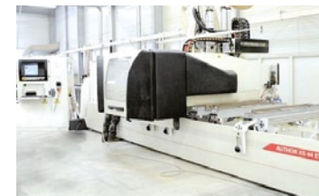
Working center for boring routing with 5 axes Brand: MORBIDELLI Model: AUTHOR X5 44 EVO