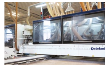
Double side squaring edge bander Brand: STEFANI Model: EVOLUTION C