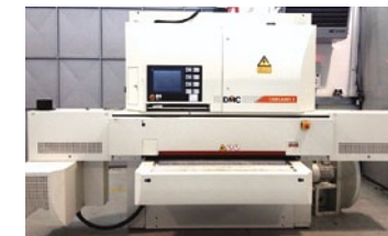
Top calibrating & sanding machine Brand: DMC Model: UNISAND K 1350 M2