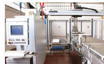
Stacker for double side squaring edge bander Brand: BARGSTEDT Model: R T SP 15/D/30/12