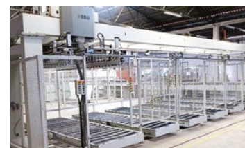
Stacker for beam panel saw Brand: RBO Model: LIFTER 2ST SC