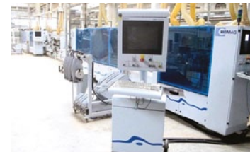
Squaring edgebanding and drilling line Brand: HOMAG + BIESSE Model: KFL 526 + TECHNO FDT CN