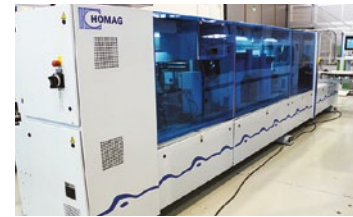
Single side edge bander Brand: HOMAG Model: KAL 310/7/A20/S2 PROFILINE