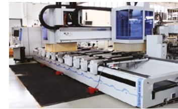
Working center for boring routing - edgebanding Brand: HOMAG Model: BAZ 322/60/AP