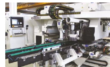
Automatic boring line Brand: MORBIDELLI + MAHROS Model: AUTHOR 924 + BRUSH