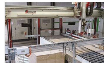
Loader for boring machine Brand: MEINERT Model: IDK-L/Q-2800/1300