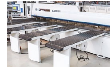
Numeric controlled beam panel saw Brand: GABBIANI Model: GALAXY T3 110A