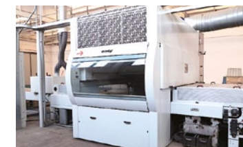
Painting line Brand: COSTA + CEFLA