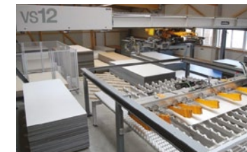
Numeric controlled beam panel saw with automatic storage Brand: SCHELLING Model: FH 4 + VS 12