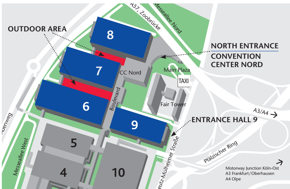
Hall allocation plan (subject to alteration)