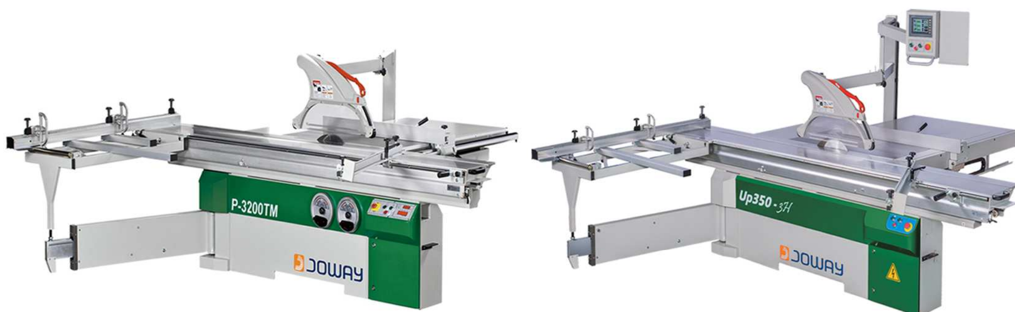
Models: P-3200TM / P-3200TA / UP350-3H