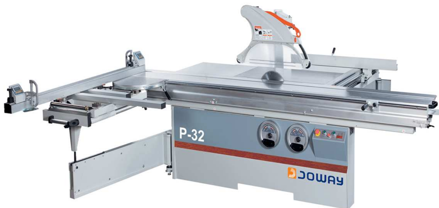
Models: P-19 / P-26 / P-32 / P-38