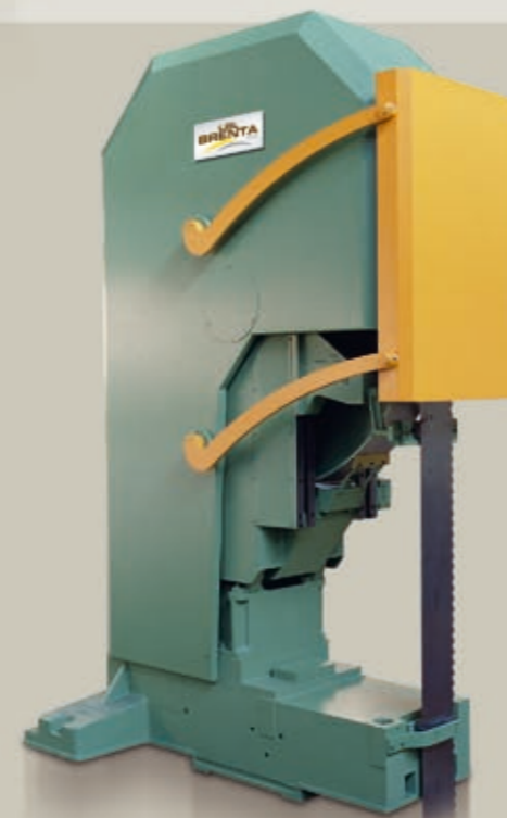
HEADRIGS XBE 140-160-180