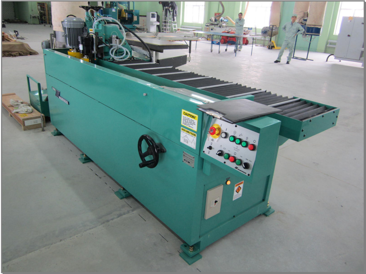
Special Precision-TWIN-HEAD-Wet-Knife-Grinding Machine GS150/200